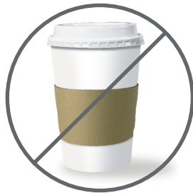
Cup with sleeve